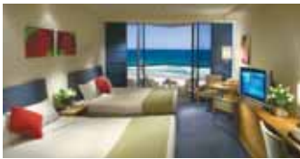
Ocean View Room